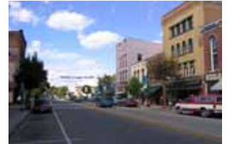
American Community Survey

Current plans are to produce these ACS data products in early summer of 2006, in advance of the release of the regular ACS data products in August 2006. More information will become available later this year about this product through the ACS Alert , the Census Bureau's electronic dissemination newsletter for the ACS.